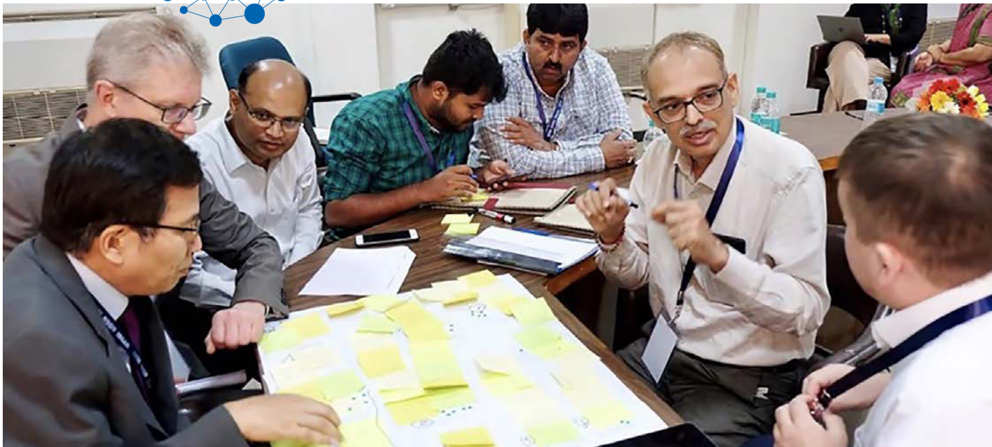
Exploring India's smart grid priorities from a global perspective—hybrid KTP workshop, Bengaluru, India, 2017